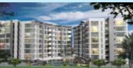
Up-coming project in Paholyothin Soi 11.

Pristine peace is also preserved by the fact that there are just four units on each floor – and only eight floors altogether, making a total of a mere 24 truly exclusive homes.